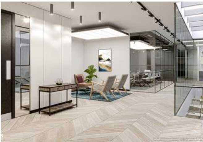
CGI Ground Floor